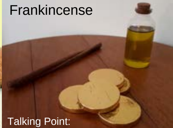
Gold, Myrrh, Frankincense